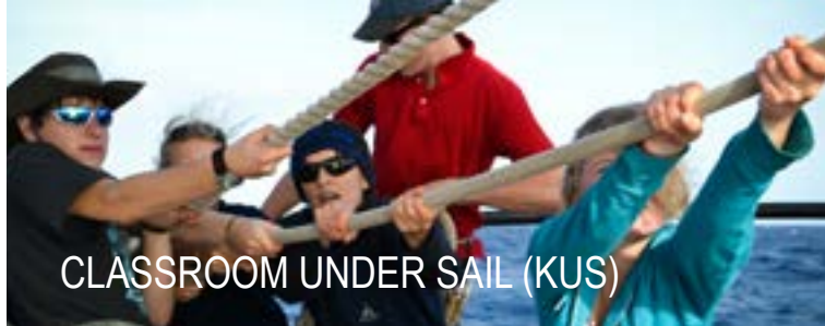
CLASSROOM UNDER SAIL (KUS)