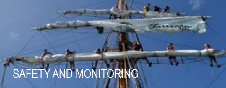
SAFETY AND MONITORING

The participating pupils will experience six months of their Fifth Form year on board a traditional sailing vessel and abroad. They will responsibly participate in ship operations, explore foreign countries and cultures during layovers of several weeks, and be taught on shore as well as at sea. These pupils will be scouts for the schools that sent them, and ambassadors of their country.